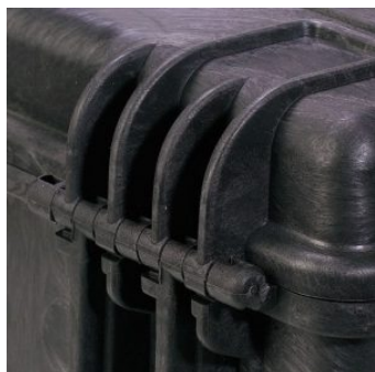
CORROSION PROOF METAL HINGES WITH LID STAY FEATURES